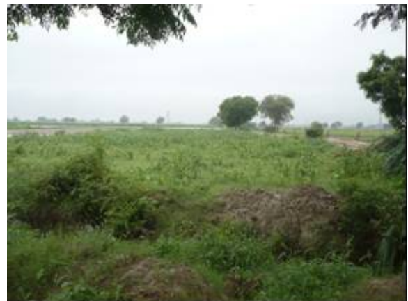
Bypass alignment passing through agricultural field