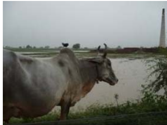
A landowner with his livestock – Considers cultivation non remunerative

16. The Entitlement Framework (EF) of the Draft ESMS and the SRP will be translated in Hindi and both the English and Hindi versions will be made available to the villagers by the implementing agency viz. Haryana State Roads and Bridges Development Corporation Limited (HSRDC). Copies of the EF and SRP will be available at the office of the Executive Engineer, Bahadurgarh Division, office of the concerned Sub-Divisional Engineer, office of the concerned village Panchayats, and its availability as part of public disclosure will be widely publicised through the village Panchayats. HSRDC will continue consultations, information dissemination, and disclosure. A Public Consultation and Disclosure Plan has been prepared for the project and is enclosed as Appendix-IV.